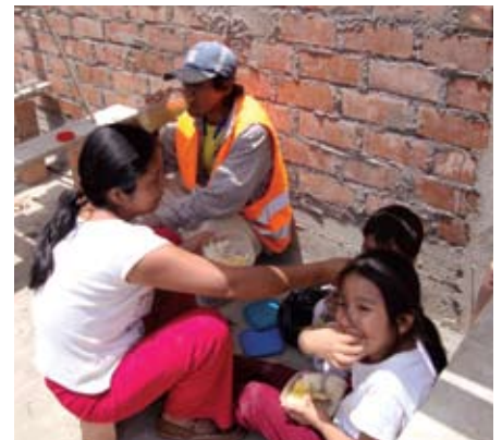
Photo: Laborer on lunch break with his family