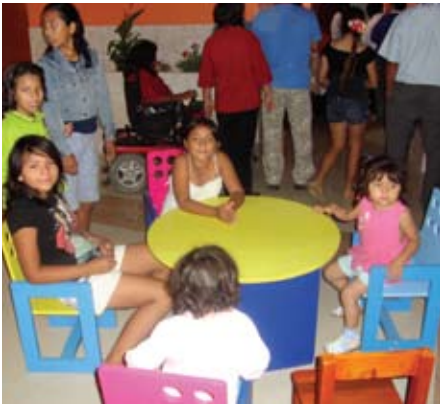
Photo: Children's Play Area - Wimbush Center

$166.00 will feed a family of 6 in Chimbote for a month.